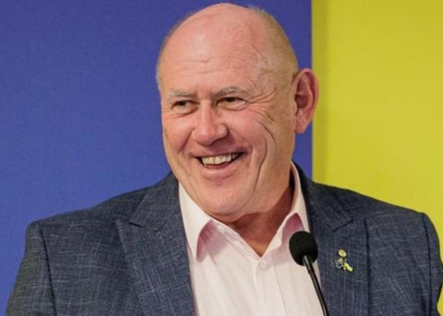
Stefan Romaniw Youth Leadership Foundation